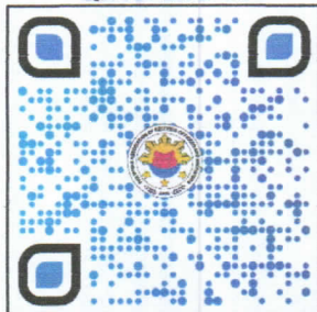
QR for Live-In

https://qr.me-qr.com/l/PAROA-Rdy4Dsstr-25LI