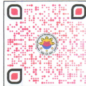
QR for Live-Out

https://qr.me-qr.com/l/PAROA-Rdy4Dsstr-25LO